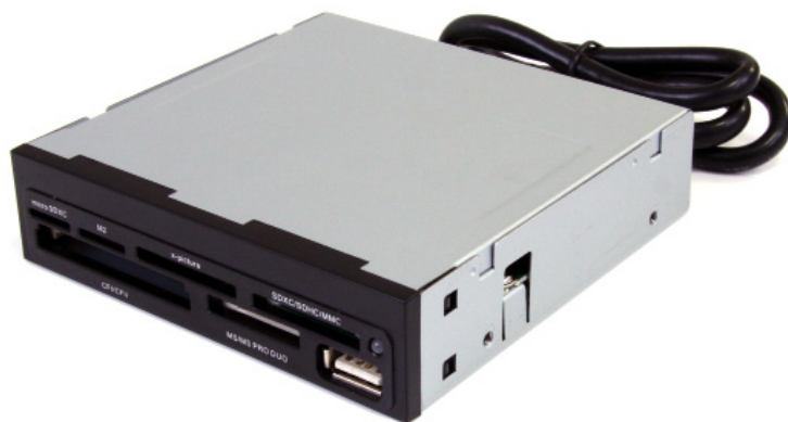
*actual product may vary from photos