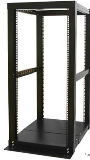
*actual product may vary from photos

WARNING! To prevent bodily injury, please ensure that the rack is installed in a structurally sound environment with a level floor and that all hardware has been assembled securely, and checked for stability before loading equipment. When installing equipment into the rack, start from the bottom of the rack first and move upwards, keeping the heaviest equipment at the bottom to avoid a situation where the rack becomes top-heavy.