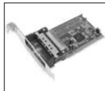
PCI2PCMCIA2 2 Port CardBus/PCMCIA to PCI Adapter Card