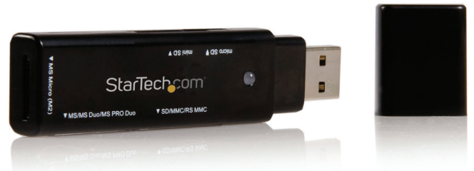
*actual product may vary from photos

DE: Bedienungsanleitung - de.startech.com FR: Guide de l'utilisateur - fr.startech.com ES: Guía del usuario - es.startech.com IT: Guida per l'uso - it.startech.com NL: Gebruiksaanwijzing - nl.startech.com PT: Guia do usuário - pt.startech.com