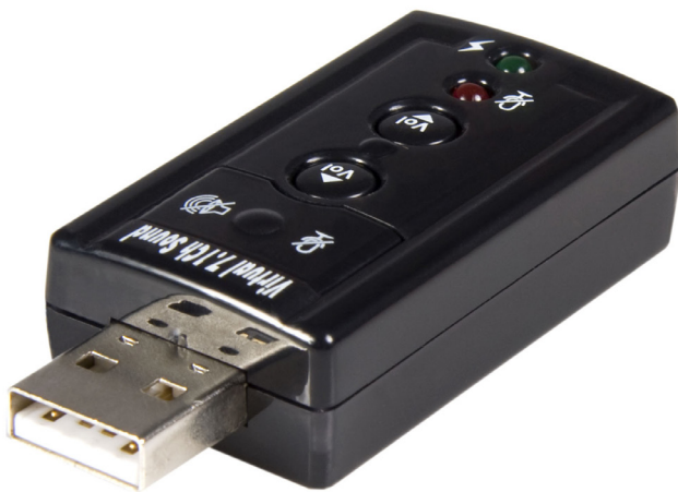
*actual product may vary from photos