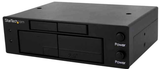
*actual product may vary from photos