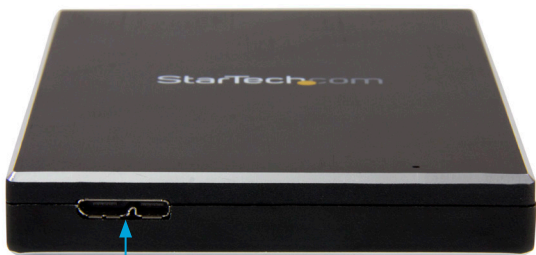
Micro-USB B port