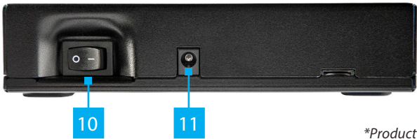
Top Edge View