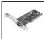
PCI1S950DV 2 Port PCI 16950 RS-232 Dual Voltage / Dual Profile Serial Card