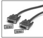
DVIDSMM10 10 ft. DVI-D Single Link Display Cable

Contact your local StarTech.com dealer or visit www.startech.com for cables or other accessories that will help you get the best performance out of your new product.