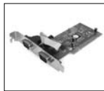
PCI2S950DV 2 Port PCI 16950 RS-232 Dual Voltage / Dual Profile Serial Card