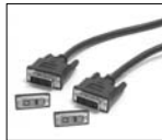
DVIDSMM20 20 ft. DVI-D Single Link Display Cable